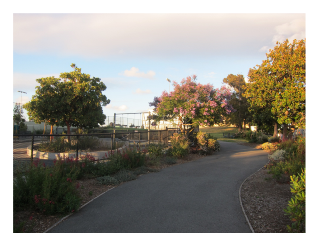
Mission light is special