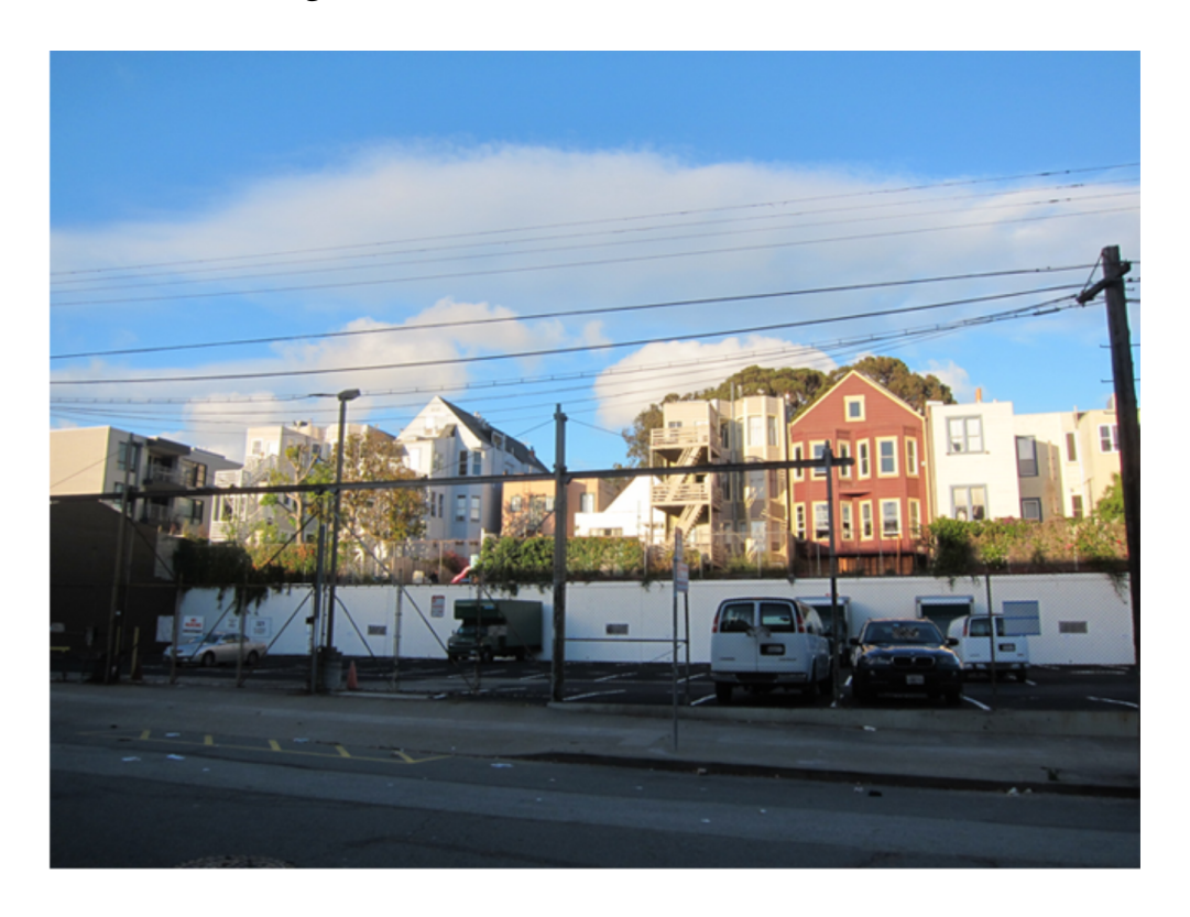
(Exhibit B) Neighborhood character and colors