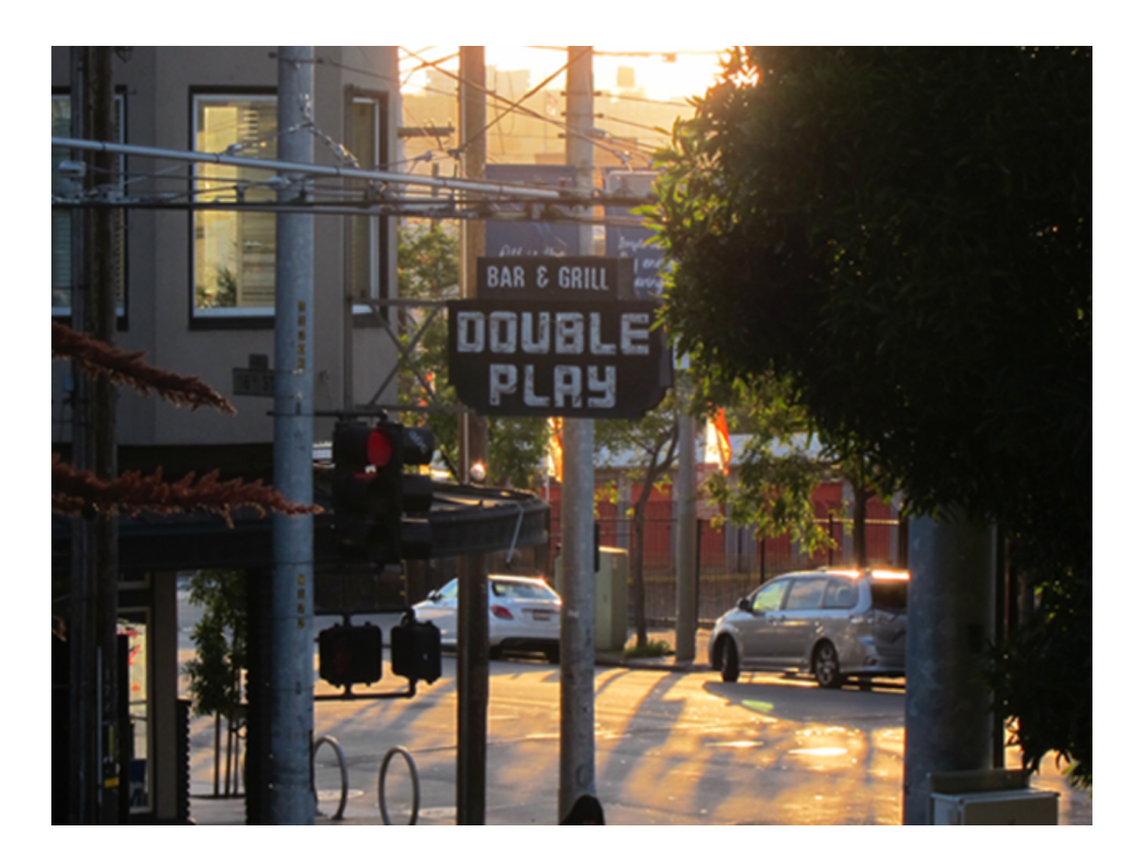
Double Play Bar and Grill